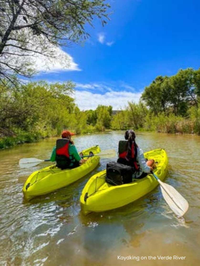
Kayaking on the Verde River