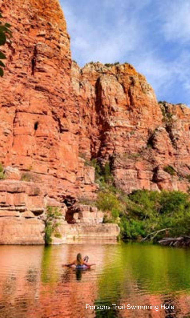
Parsons Trail Swimming Hole