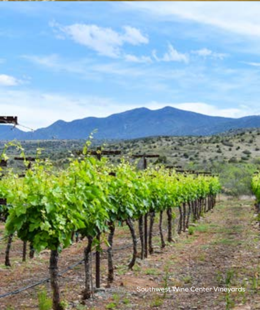
Southwest Wine Center Vineyards