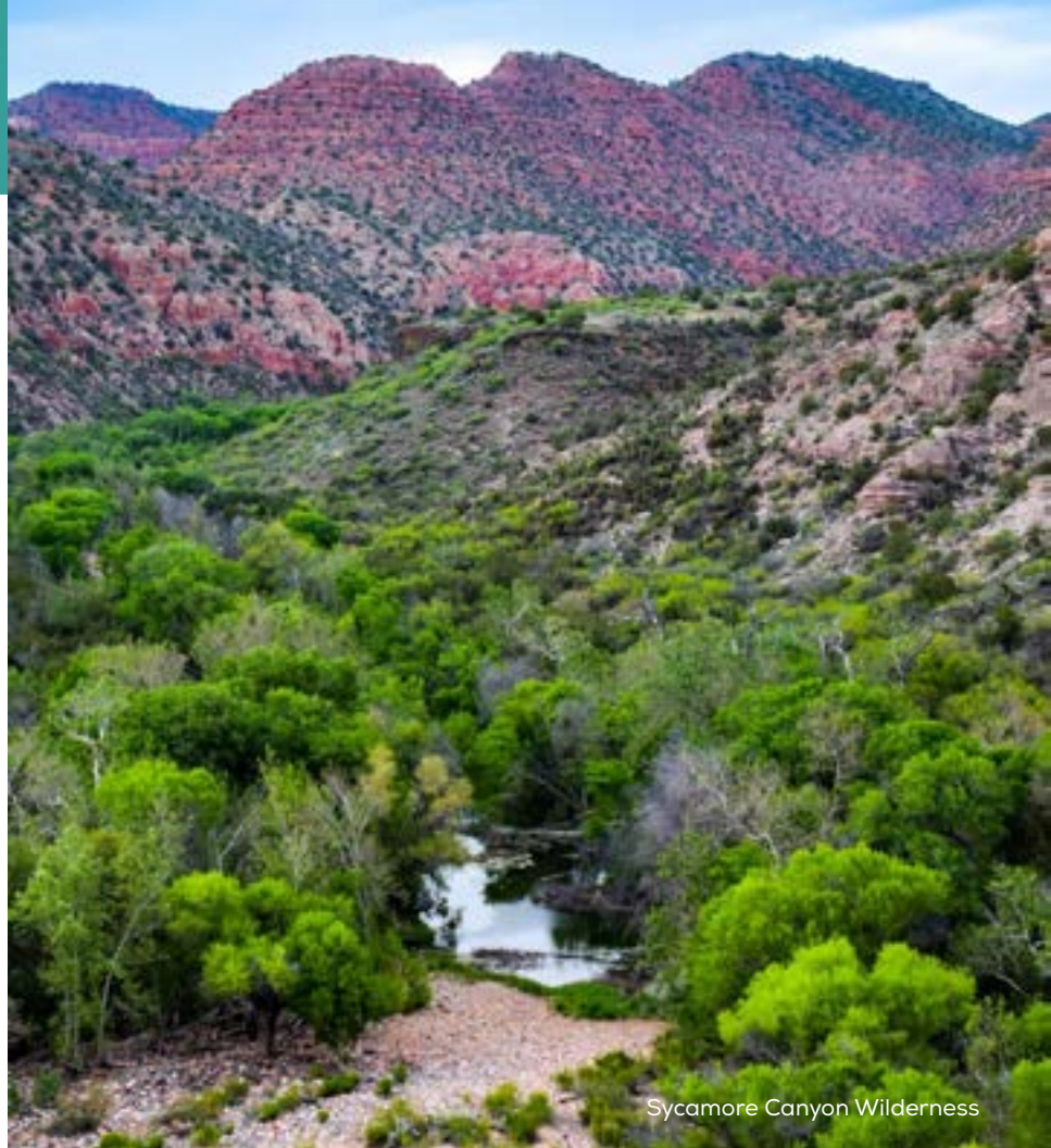
Sycamore Canyon Wilderness