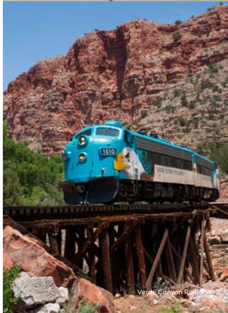
Verde Canyon Railroad