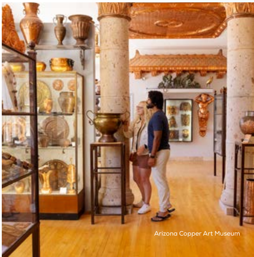
Arizona Copper Art Museum