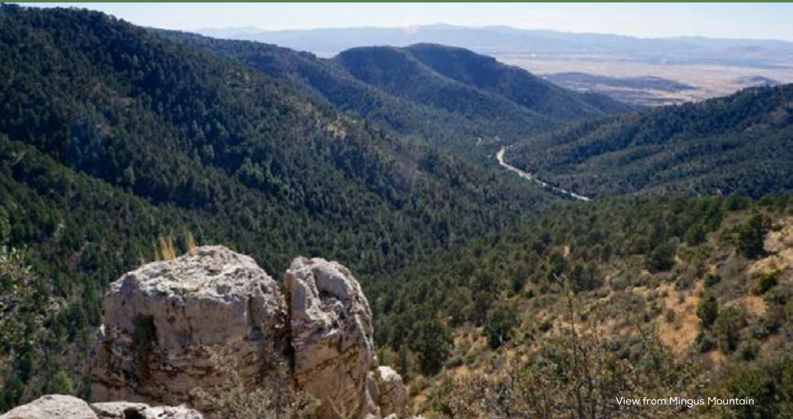
View from Mingus Mountain