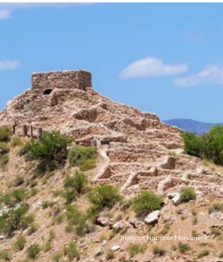
Tuzigoot National Monument

Beyond these, Clarkdale also has a robust selection of Airbnb / VRBO options scattered across the area for those who prefer a more private or home-style stay.